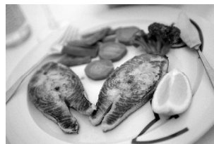
Table of Six

On Sunday April 29, 2007 following the 10:30am service a Voter's Meeting will be held in the Fellowship Hall.